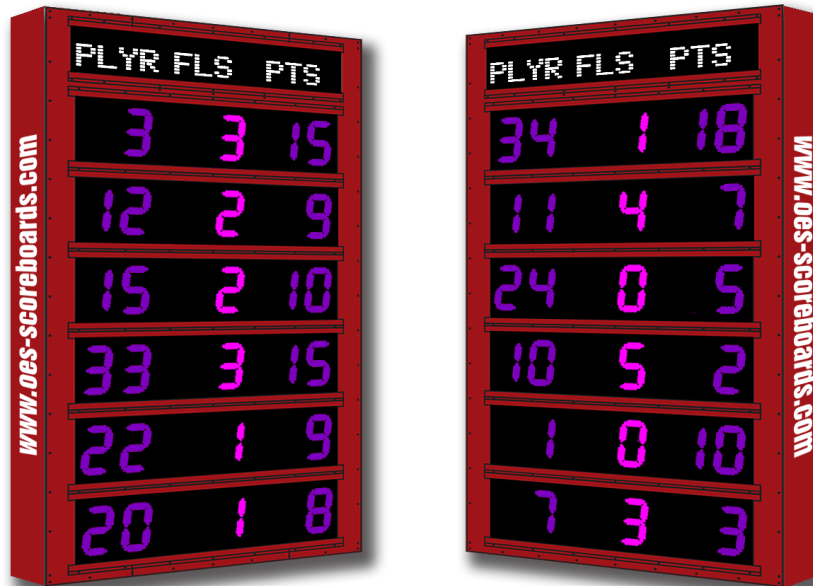
Model M5004S - Electronic captions, ColorCast neon pink, purple and white digits, Red (RAL3002) enclosure